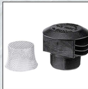
Mushroom vent with bug screen for better ventilation.