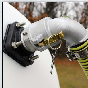
Bolted tank connections w/316SS hardware instead of threaded fittings.