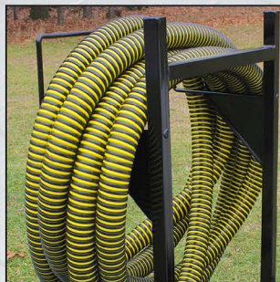
High grade, light weight, flexible hoses.