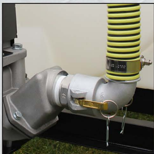
Aluminum quick connect couplings.