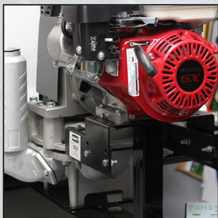
Engine and pump are supported by trailer frame.