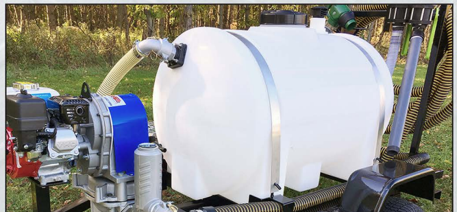
High density linear polyethylene (HDLPE) tank with custom fabricated durable trailer. Easily towed to where you need it.