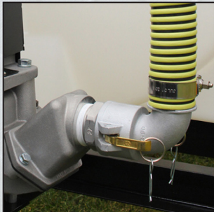
Aluminum quick connect couplings.