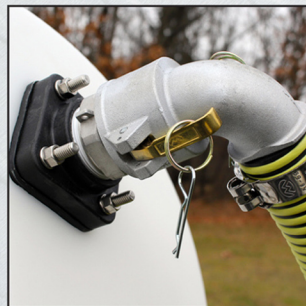
Bolted tank connections w/316SS hardware instead of threaded fittings.