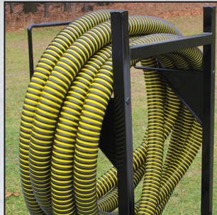
High grade, light weight, flexible hoses.