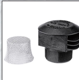
Mushroom vent with bug screen for better ventilation.