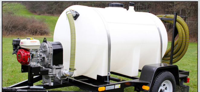
High density linear polyethylene (HDLPE) tank with custom fabricated durable trailer. Easily towed to where you need it.