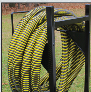
High grade, light weight, flexible hoses.