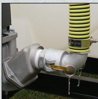
Aluminum quick connect couplings.