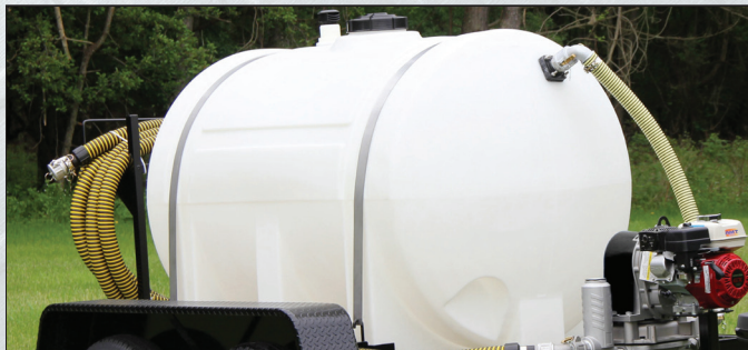
High density linear polyethylene (HDLPE) tank with custom fabricated durable trailer. Easily towed to where you need it.