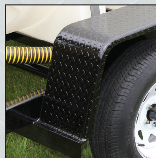
All trailers have large fenders for easy tank clean outs.